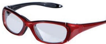
ITEM: LT500 Maxi

Manufactured of lightweight nylon and designed to provide protection for the entire eye area. The curved front and temple bar with rubber tips allow for a close secure fit. Available in Black, Silver, Red, and Carbon Gray. Weight: 58 grams