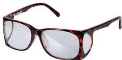
ITEM: LT5050 Wrap

These flexible safety frames can be adjusted for a more custom fit. The front of the frame is fitted snugly to the brow to help alleviate fluid run-off into the eyes. Weight: 75 grams