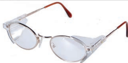
ITEM: LT600 MetalFlex

A lightweight, wrap-around nylon frame with built-in adjustable nose piece to distribute weight evenly over the nose. The earpieces are attached by spring hinges designed to withstand the rigors of hospital use. Weight: 85 grams