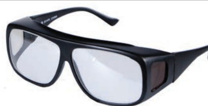
ITEM: LT400 Fitover

These frames are constructed of optical steel base metal electroplate. Each pair is made with an adjustable non-slip silicone nose pad for maximum comfort. Weight: 62 grams