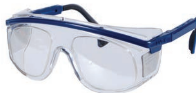
ITEM: LT300 Astro

The Maxi is slightly smaller than the Ultralite and includes a soft rubber nose bridge for increased comfort. Available in Black, Silver, Red, and Navy. Weight: 63 grams