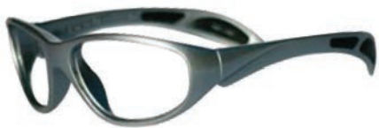
ITEM: LT100 Ultralite

All glasses are made with the highest quality glass and offer .75mm lead equivalency. Most styles are available in Single, Bifocal, and Progressive prescriptions.