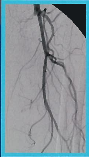
Thrombosed femoral stent