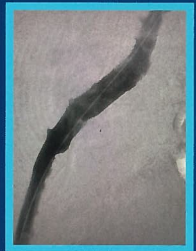
Post stent, vein fully patent