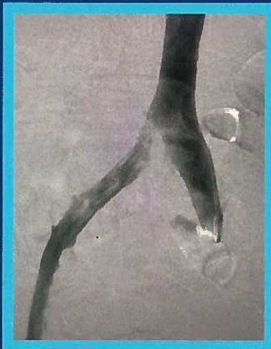
Post JETi thrombectomy and balloon maceration