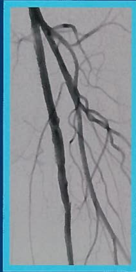
Post JETi thrombectomy, vessel fully patent