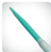
Radiopaque band available