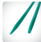
.018" dilator vs .038" dilator

GALT's Micro-Access ELITE HV™ Hemostasis Valve Introducer Kits provide the high quality expected for use during Cardiac Cath Lab and interventional procedures. They are specially designed to provide consistent performance every time.